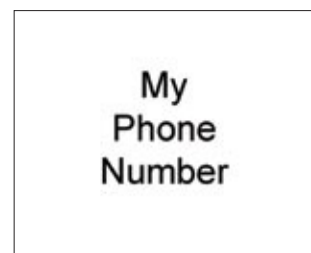
Selling My Phone Number Mixed media / 2007