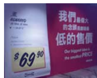
Arts, Ready to Hang 藝術·一掛即可 2008