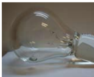
Light Bulb / Blown Glass 100 x 120 x 70 mm / 2007