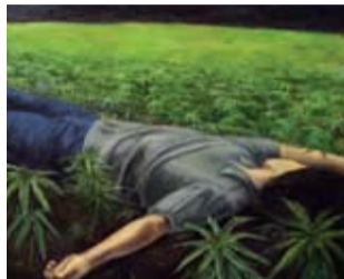
The Six Hours / Painting:32"x37" Video: 3'07 / 2007