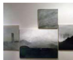
Untitled / Acrylic on canvas 130 x 96 cm / 64 x 64 cm 60 x 50 cm / 60 x 50 cm / 2007