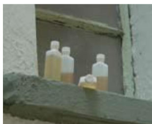
The Memory of Water / Mixed Media 2008