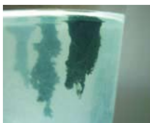
Time to Draw / Ink and Agar Cake (mixed with water), colour, glass, stick 22.5cm x 8cm, around 1.5 months / 2008