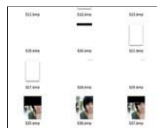
Remember to Forget 想起·忘記 Computer procedure / Loop / 2008

VENUE / No. N5, Cattle Depot Artists Village, 63 Ma Tau Kok Road, To Kwa Wan, Kowloon, Hong Kong DATES / 22 - 30 Mar 2008