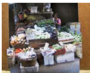
Spatial transformation 空間的變奏 Photography, Paper / 8.5" x 11" / 2'14" 2007