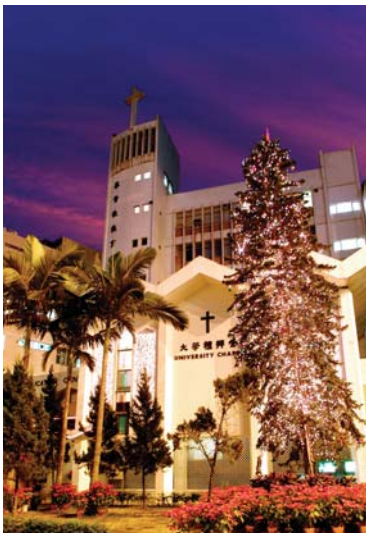
■ Christian Education Centre