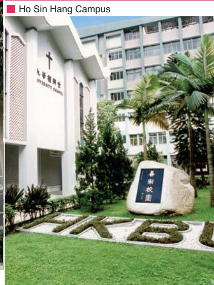
■ Ho Sin Hang Campus