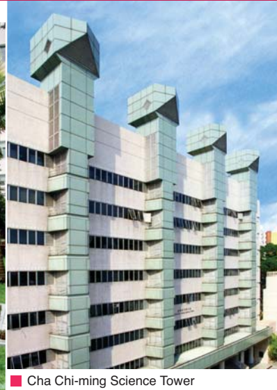
■ Cha Chi-ming Science Tower