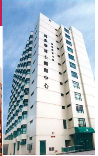
Dr Ng Tor Tai International House

environment. There are three campuses, the Ho Sin Hang Campus at Waterloo Road, the Shaw Campus at Renfrew and Junction Roads and the Baptist University Road Campus.