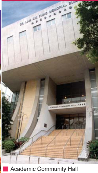
■ Academic Community Hall