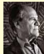
Professor Torsten N. Wiesel Torsten N. Wiesel教授