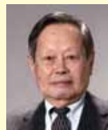
Professor Chen Ning Yang 楊振寧教授