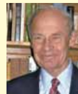
Professor Dudley R. Herschbach Dudley R. Herschbach教授