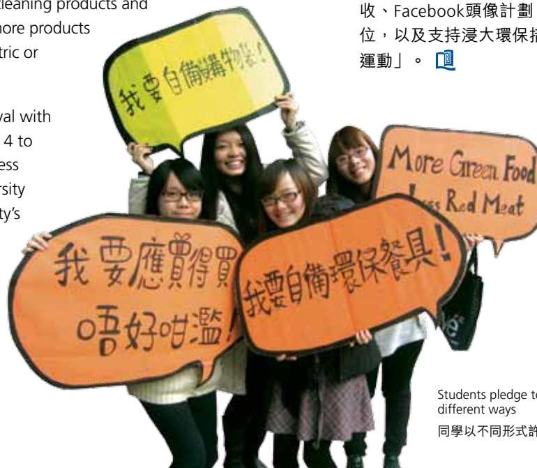
Students pledge to protect the environment in different ways