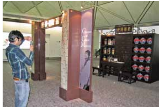
An exhibition entitled "Glimpses of Chinese Medicine" at Terminal 1 of Hong Kong International Airport