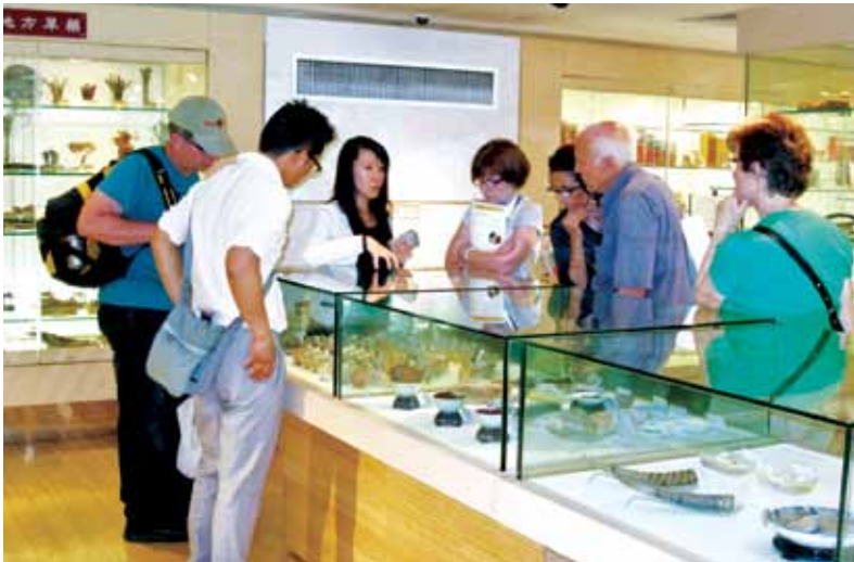
Guided tour in English for overseas visitors at the Dr. & Mrs. Hung Hin Shiu Museum of Chinese Medicine