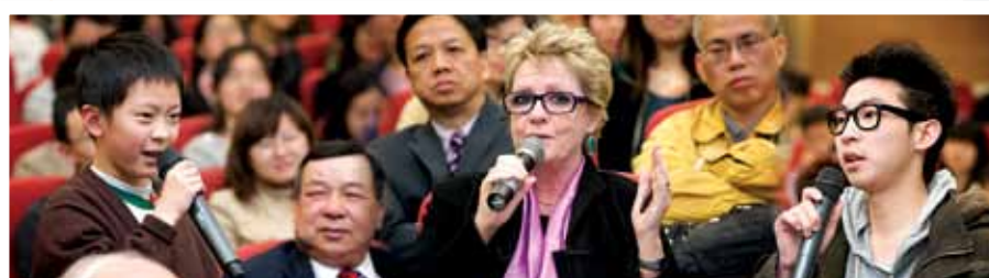
The audience is keen on discussing and exchanging views with the Nobel Laureates during the lectures and the forum 在講座和論壇上，觀眾熱切地與幾位諾貝爾得獎人討論和交流