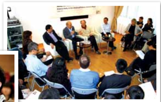
At a sharing session, Professor Wiesel and Professor Herschbach meet more than 50 HKBU postgraduate students and young scholars and exchange views on creativity 在一個分享會上，Wiesel教授和Herschbach教授與五十多位浸大研究生和年輕學者聚談，交流創意之道