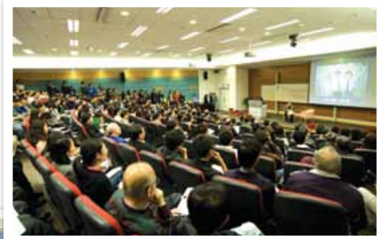
The lectures, the forum and the exhibition attract an overwhelming response from donors, alumni, staff, students, media and the public 講座、論壇和展覽吸引許多捐款人、校友、教職員、學生、傳媒和公眾參加，座無虛席