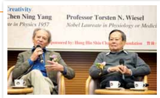
Professor Wiesel (left) and Professor Yang share their views on creativity at a forum Wiesel教授(左)與楊振寧教授在論壇上分享對創意的看法