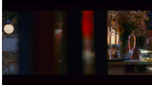
Figure 21 My Blueberry Nights .

Yet Wong sets off these opaque tactics with legible cues. The mid-ground plane in which Elizabeth is located remains in sharp focus at all times. Centering of the protagonists occurs thanks to movement of camera and characters. And as the tracking camera comes to rest, the window lettering – an obtrusive element moments earlier – flanks and highlights Elizabeth’s head (Figure 22). (That is, the inscription now functions as a cue reinforcing the shot’s point of interest. It also primes the ensuing shot, which magnifies the area highlighted by the window inscription [Figure 23].)