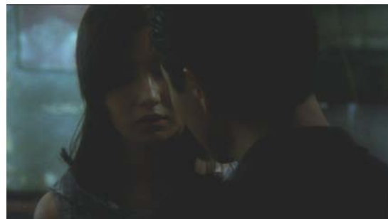
Figure 2 Days of Being Wild (1991).