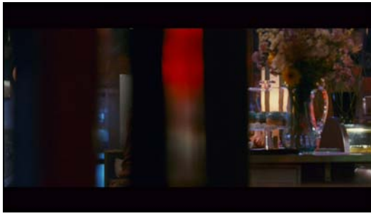
Figure 24 My Blueberry Nights .