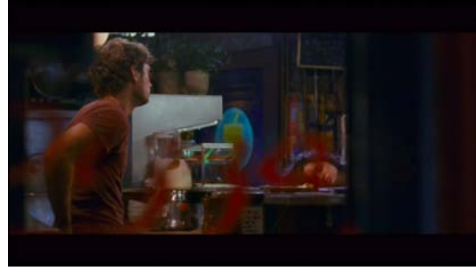
Figure 25 My Blueberry Nights .

Wong not only strives to balance opacity and legibility; he also manages to modulate attention, achieving the sort of fluid hierarchization of detail described by Eisenstein, or what Charles Barr calls a “gradation of emphasis” (Barr 1963: 18-19). The shot alternates its centres of interest, subjecting clarity to a pattern of blockage and disclosure. As the camera tracks sideways, Elizabeth is masked off by the vase of flowers, briefly highlighting Jeremy and registering his furtive glance at her. Now the moving camera encounters a foreground column, causing Jeremy to slip out of view and throwing emphasis – albeit obliquely – onto Elizabeth, tucked into an aperture. As the column then blocks our view of Elizabeth, attention is cued toward Jeremy – glimpsed at first through a crevice (Figure 24), and then in more communicative medium shot (Figure 25). The window design impedes our sight of Elizabeth as she reappears, pressing us to notice Jeremy’s prolonged gaze at her, and hinting at his romantic desire. (Note that Wong finds a fresh device – the foreground window design – to disturb clear facial views.) Finally, Jeremy retreats to a position almost wholly off screen, restoring emphasis to Elizabeth whose head emerges neatly between two red swirls (Figure 22). In its nuances and embellishments, the shot exceeds the simple transmission of information that Chungking Express handles more succinctly.