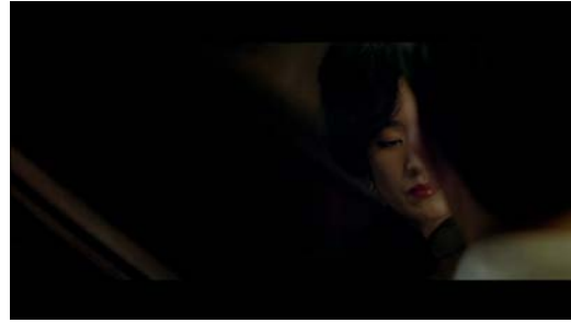
Figure 9 2046.