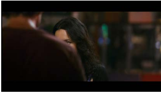
Figure 10 2046 .