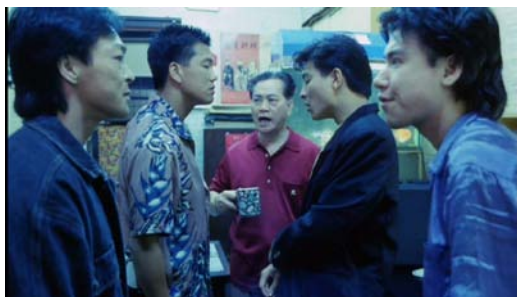
Figure 1 As Tears Go By (1988).

Wong makes the denial or disturbance of facial access a major strategy. Days of Being Wild (1991) offers Wong’s first sustained exploration of this strategy, roughening form and perception by occluding faces with obstructive elements. Even communicative framings do not guarantee pristine views – in one scene, close singles and frontal staging provide an optimum vantage point from which to view Su Lizhen (Maggie Cheung), but intrusive shadow and oblique body posture (Su’s lowered head and downward glance) conspire to conceal legible facial expression, while also hinting at Su’s timidity. Sometimes other characters impede facial access, as when Yuddi’s aggressive seduction of Su is conveyed by oppressive over-the-shoulder shots (Figure 2). Granted, the clean, facial close view remains a standard device throughout Wong’s oeuvre; at times Wong can’t resist lingering on the sensuous visages of his photogenic players (Figure 3). But such compositions operate in counterpoint to less instantly readable images. Indeed, the blocked facial view in Wong’s films typically works in concert with facial access, roughening rather than retarding visual perception.