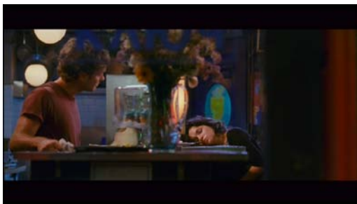
Figure 20 My Blueberry Nights .