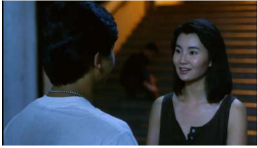
Figure 6 As Tears Go By.