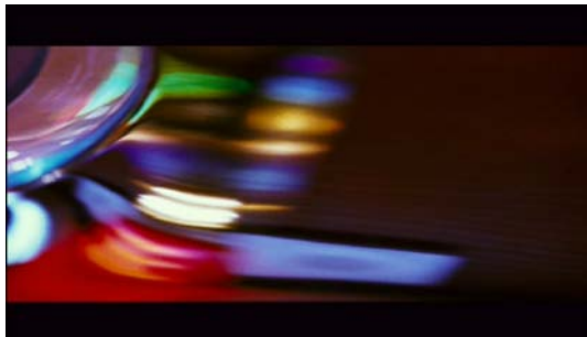
Figure 30 My Blueberry Nights .