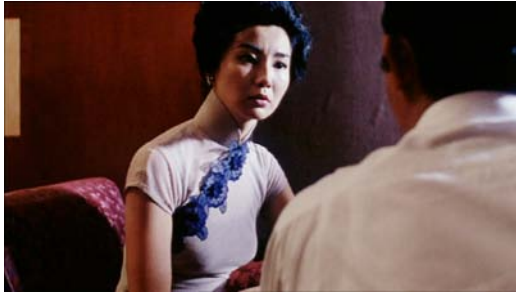
Figure 15 In the Mood for Love.