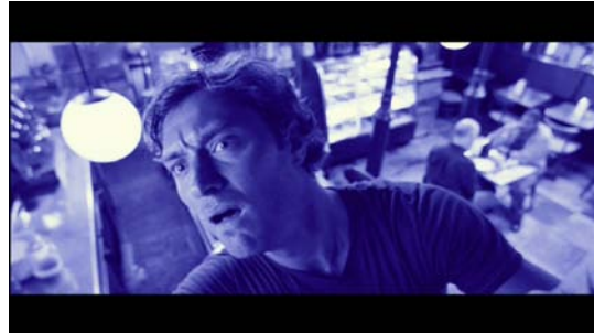
Figure 29 My Blueberry Nights .