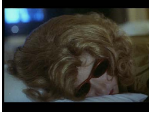
Figure 19 Chungking Express .