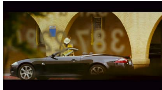
Figure 33 My Blueberry Nights .

These shots hint at the motivic use of colour too. Each plot phase in My Blueberry Nights is assigned a dominant colour scheme – deep blues and greens in New York; hot reds and oranges in Memphis; golds and tans in Nevada and Vegas. Wong's bold colour palette owes a debt to both Hong Kong's popular cinema (recall Zhang Che, Ringo Lam, and John Woo) and the European art cinema (think of the vibrant colour schemes in certain films by Godard, Bergman, and Antonioni). Like the exponents of those traditions, Wong handles film colour expressively. In My Blueberry Nights , the coloured lights that coruscate in background planes endow scenes with a tender, romantic quality. When Arnie is publicly spurned by his