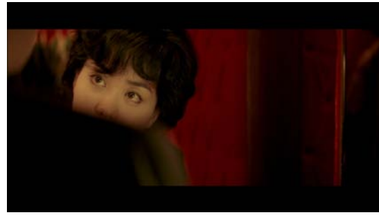
Figure 11 My Blueberry Nights (2007).