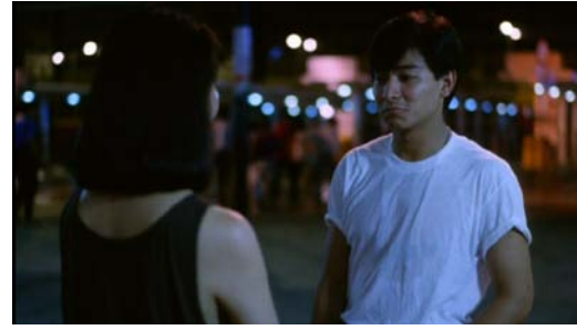
Figure 7 As Tears Go By.