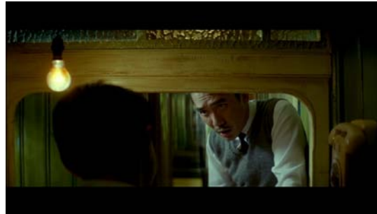
Figure 5 2046 .

The tactic of muddying facial close-ups points toward a wider approach to filmic conventions in Wong’s cinema – the perverse treatment of traditionally communicative techniques. Consider the over-the-shoulder (OTS) shot, often integrated into an alternating shot/reverse-shot pattern. In the traditional OTS schema, the shot is composed so that the figure facing the camera is clearly visible. We see this schema operating in As Tears Go By , combined with the shot/reverse-shot structure (Figures 6–7). In subsequent films, however, Wong exploits this schema to fit his program of visual disturbance. An instance noted above occurs in Days of Being Wild (Figure 2), where camera position creates overlapping figures. In the Mood for Love displays a striking alternative when Su (Maggie Cheung) is upbraided by her landlady (Figure 8). While Su, the back-to-camera figure, dominates the centre foreground in sharp focus, the landlady delivers her lecture in a shadowy haze. Wong here reverses the traditional centre of interest in the OTS schema, throwing emphasis on the foreground agent. But although attention is cued toward Su, Wong’s repressive framing prohibits facial access. In keeping with the film’s atmosphere of understated melodrama, the viewer is invited to infer Su’s scolded reaction without the aid of expressive character behaviour.