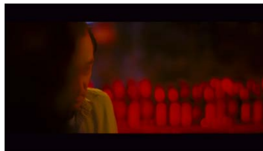
Figure 27 My Blueberry Nights .

The tendency toward an abstract style is embodied in several of the film’s visual motifs. The café’s window art yields brightly coloured curlicues that swirl romantically around the characters. Similarly, mottled lights amplify the romantic tenor of dialogue scenes. Bold, saturated colours are pulled into motivic arrangement – in the café, the blue of Jeremy’s shirt complements both the column