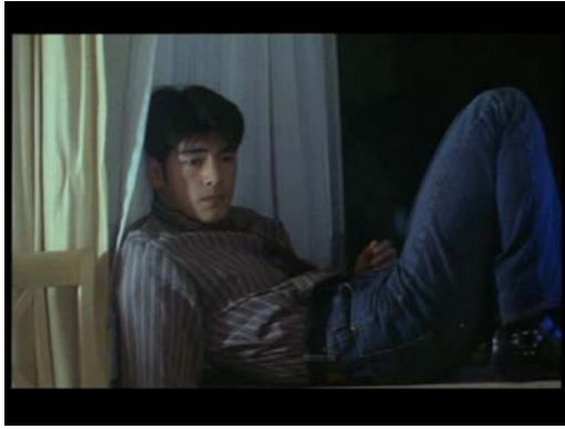
Figure 18 Chungking Express (1994).