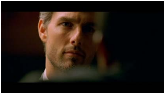
Figure 12 Days of Being Wild .