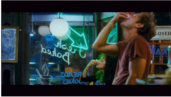
Figure 17 My Blueberry Nights .

foreground, are deemphasised thanks to selective focus. (Nevertheless, we probably notice the characters' synchronised gestures, which betray a more pervasive self-consciousness shaping the film's visual narration.)