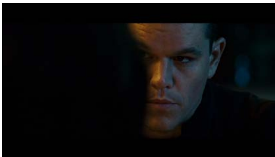
Figure 14 The Bourne Ultimatum (2007).

Like 2046 , In the Mood for Love flaunts the OTS schema, but puts the device to deceptive effect. Two neighbours, Su and Chow (Tony Leung Chiu-wai), suspect their spouses of a romantic affair. Together they re-enact the overtures between their partners in an attempt to determine how the affair began. Chow urges Su to confront her husband proper and force a confession of infidelity. Following an ellipsis, Wong cuts to an OTS medium shot of Su as she accosts the foreground figure with her suspicions (Figure 15). Cunningly, Wong postpones the reverse shot of the male figure, allowing the viewer's inferences to mount before finally supplying the anticipated image. The reverse shot carries a sting of surprise: the man addressed by Su is not her husband, but Chow (Figure 16).