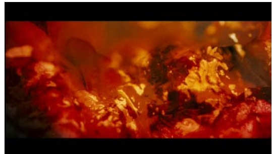
Figure 31 My Blueberry Nights .