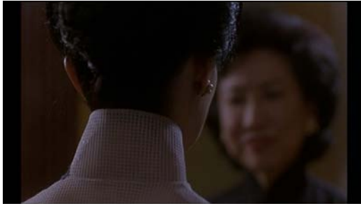
Figure 8 In the Mood for Love (2000).