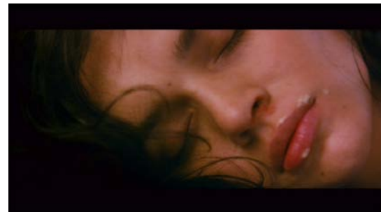
Figure 23 My Blueberry Nights .