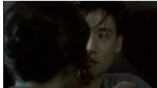
Figure 13 Collateral (2004).