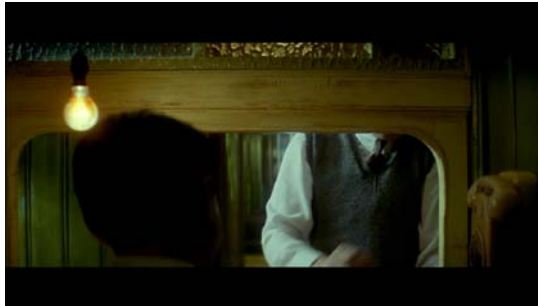
Figure 4 2046 (2004).

“dominant” (Jakobson 1971), unifying his oeuvre not only stylistically but at other levels of storytelling outside this paper’s purview.