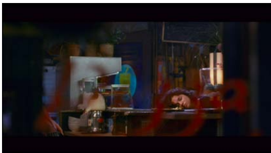
Figure 22 My Blueberry Nights .

Yet Wong sets off these opaque tactics with legible cues. The mid-ground plane in which Elizabeth is located remains in sharp focus at all times. Centering of the protagonists occurs thanks to movement of camera and characters. And as the tracking camera comes to rest, the window lettering – an obtrusive element moments earlier – flanks and highlights Elizabeth’s head (Figure 22). (That is, the inscription now functions as a cue reinforcing the shot’s point of interest. It also primes the ensuing shot, which magnifies the area highlighted by the window inscription [Figure 23].)