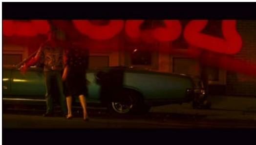
Figure 32 My Blueberry Nights .

Nor does the café's window design merely embroider the image. As already suggested, Wong exploits this feature of mise-en-scène for narrational purposes, creating visual payoffs by masking and revealing faces, and by guiding the eye toward relevant niches of action. In addition, our attention is strained by the compulsion to read the window writing. Consequently, Wong deemphasises the motif through focal tactics and other means at moments of dramatic importance. But Wong also patterns the device across the film's distinct plotlines. The window motif is most prominently a feature of Jeremy's café, but it surfaces in the film's other major plot strands too – the second episode set in Memphis (the bar), and the subsequent action line in Nevada and Las Vegas (the hospital) (Figures 32–33). Functioning as a cohesion device, the window motif cannot be reduced to a mere stylistic flourish; rather, it is made a function of large-scale narration, helping to knit the distinct plot episodes together.