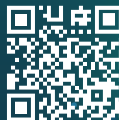
Facts and figures