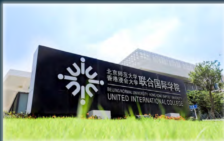
Beijing Normal University - Hong Kong Baptist University United International College