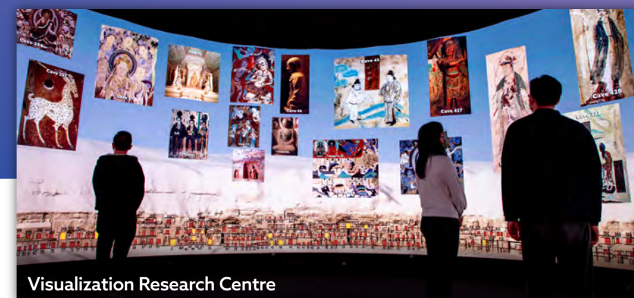
Visualization Research Centre